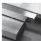
Precision flat steel with machining allowance [PFS/BA] L: 500 mm